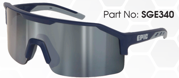
Part No: SGE340