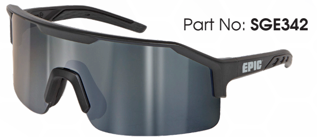
Part No: SGE342