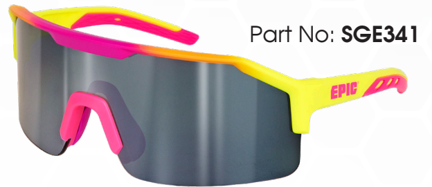
Part No: SGE341