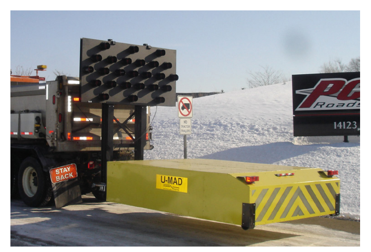
The U-MAD TMA offers a variety of quick mounting options to make deployment and removal safe and easy.